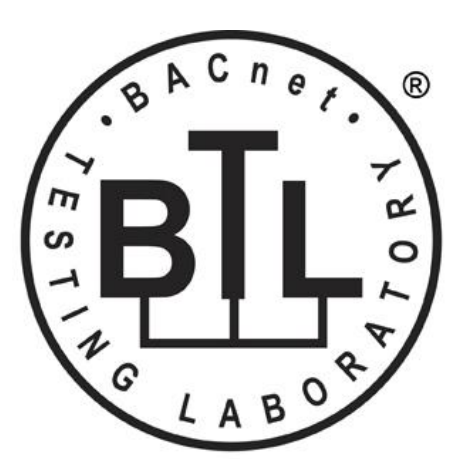
BACnet is a registered trademark of ASHRAE. ASHRAE does not endorse, approve or test products for compliance with ASHRAE standards. Compliance of listed products to requirements of ASHRAE Standard 135 is the responsibility of the BACnet International. BTL is a registered trademark of the BACnet International.

4-pipe/2-pipe heating and cooling with staged, modulating, and floating outputs